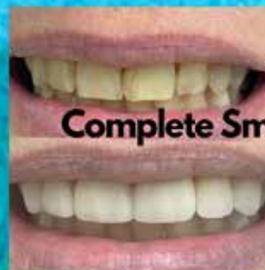
Complete Smile Makeovers